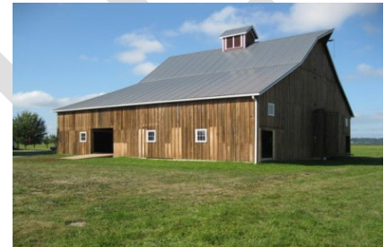
Johnson Barn - Skagit County

Heritage Barn Grant Program — The Trust continues to administer this successful program on behalf of the Department of Archaeology and Historic Preservation, providing grants to assist heritage barn owners in maintaining and restoring some of our state's most cherished and iconic structures. The Washington State Advisory Council on Historic Preservation has designated nearly 600 agricultural structures as official heritage barns with each county in the state represented.