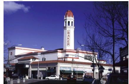
Bellingham's historic Mount Baker Theatre