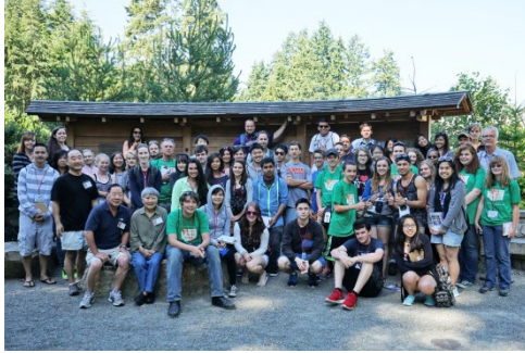
YHP Students in Seattle's Chinatown/International District

Discover Washington: Youth Heritage Project: Youth Heritage Project (YHP) is a four-day interactive field-school that engages high-school students and teachers by connecting them to historic, cultural and natural resources. YHP is designed to introduce the topics of preservation and stewardship to a younger generation in order to cultivate future leaders in the preservation movement. Previous YHP events have taken place in the Yakima Valley, Mt. Rainier National Park, Ebey's Landing National Historical Reserve on Whidbey Island, and Seattle's Chinatown/International District. This year's YHP