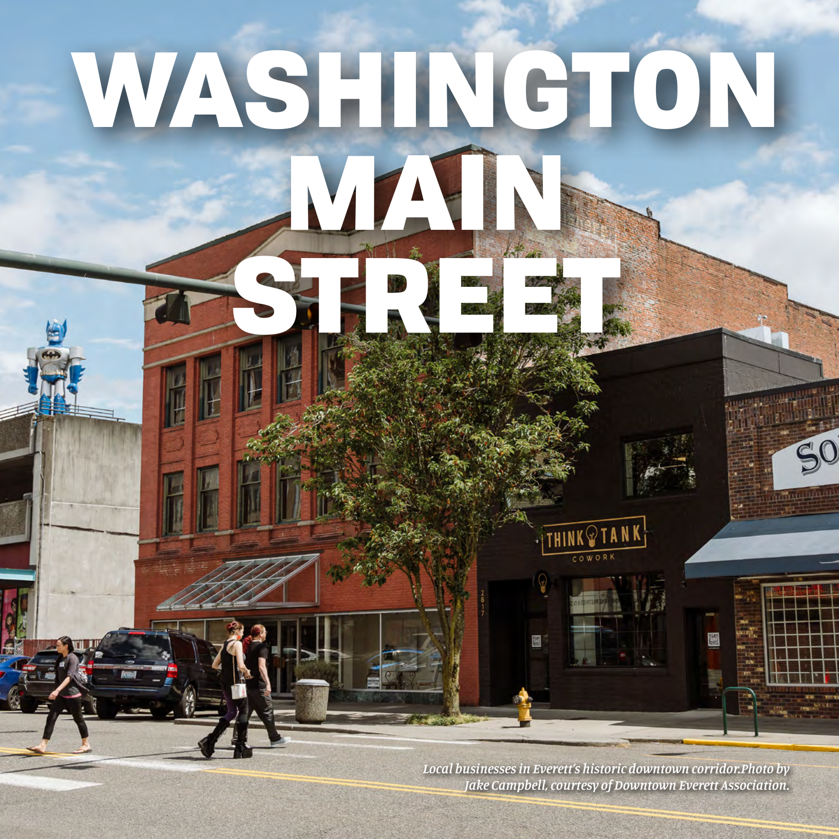
Local businesses in Everett's historic downtown corridor.